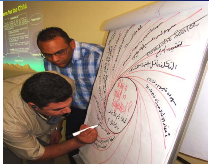
Group activity on child trafficking during training for Law Enforcement in Egypt, June 2008.

IOM's counter trafficking activities build the capacity of both government and civil society institutions to better address the